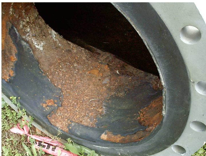
Chemical attack behind a rubber lined carbon steel pipe

The problem with rubber lined piping systems is that the rubber can be permeated by a wide variety of corrosive media. Once permeated, the corrosive media is able to freely attack the substrate behind the rubber lining (typically steel) and corrode it significantly. Ultimately, the rubber liner loses adhesion to the steel substrate and breaks away to plug filters, nozzles and pumps which lie downstream from the lined equipment. Expensive, unplanned outages are the result.