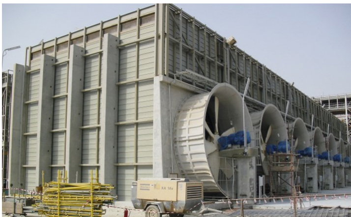
Pultruded profiles and panels for cooling tower in corrosive environment

A light-weight all composite transport trailer was developed to minimize trailer weight and consequently increase its net payload. Pultruded structural beams made with DM 640 resin provide high strength and stiffness into the trailer chassis. It also incorporates unique sandwich panels made with three-dimensional stitched composite technology for the floor and side walls. DM 640 Resin met the project's demanding mechanical property requirements and need for excellent corrosion resistance. The resin also delivered the fatigue and creep resistance these large trailers require when used rough environments. Comprehensive road tests showed that the 'all composite trailer' had a far better 'road grip' compared to standard trailers. The full composite chassis and superstructure design on this innovative trailer is clearly a door opener for further light weighting applications in automotive and industrial markets.